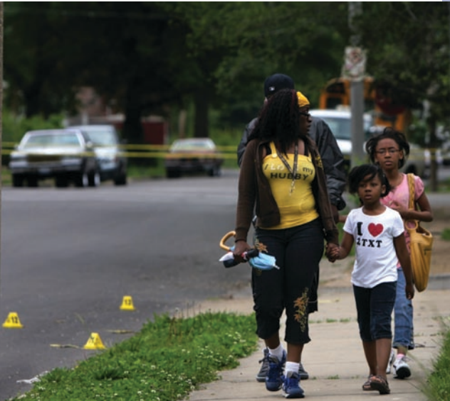
After a man is gunned down at the Ford Elementary School parking lot in St. Louis last April, a woman took her niece and daughter out of school. She and the girls walk past police evidence markers on their way back home.